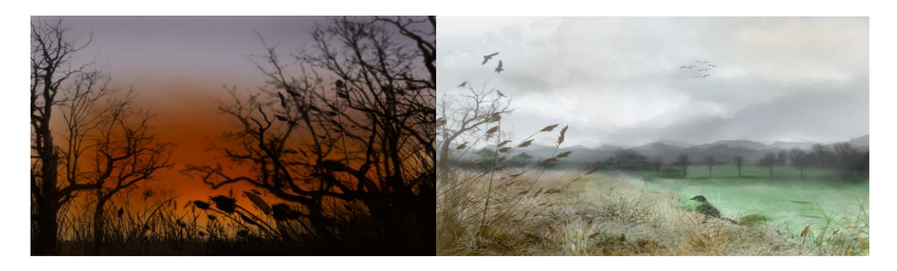
(left) Sample student designs and (right) Digital photo taken with a digital brush both made with the Photoshop CS6 application